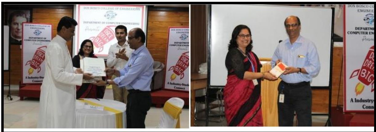
MOU Signed with PSL on 14 th February 2020

Persistent Systems Limited (PSL) a technology services company based in Pune and having its office at Verna – Goa. They provide services for digital business strategy, product engineering, data driven intelligence and Core IT Management service, amongst many others. Under this MoU, PSL provides training and research requirements to students and staff, student project sponsorship, support for Project Evaluation and conduct of workshops, seminars and guest lectures.