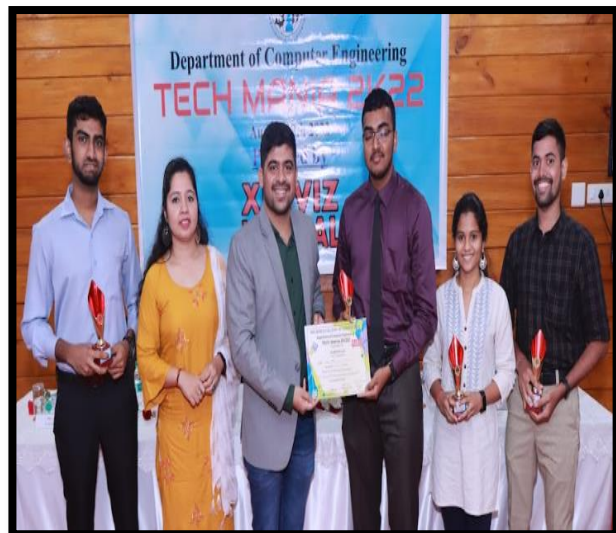
Tech Mania 2022, Powered by Xerwiz Wlobal